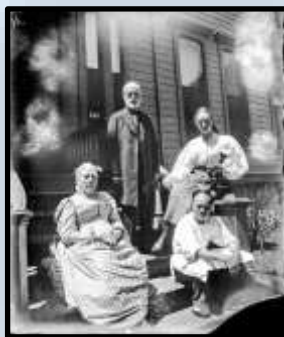
Unidentified Oregon family with their Chinese cook.