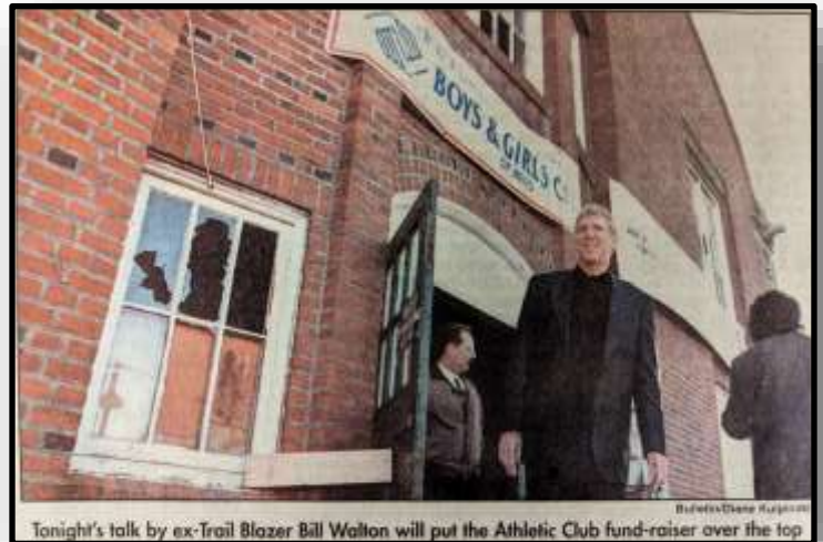
Tonight's talk by ex-Trail Blazer Bill Walton will put the Athletic Club fund-raiser over the top.

The massive price tag to renovate the old Bend Amateur Athletic Club building required a fundraiser with a big draw. Enter Bill Walton. Walton attributed the teamwork of playing basketball at the Boys Clubs and rec centers in San Diego with guiding him in his youth, and was happy to support the cause. He was the featured speaker at the sixth annual Gala at the Riverhouse on January 19, 1998, a benefit for the restoration of the Bend Amateur Athletic Club.