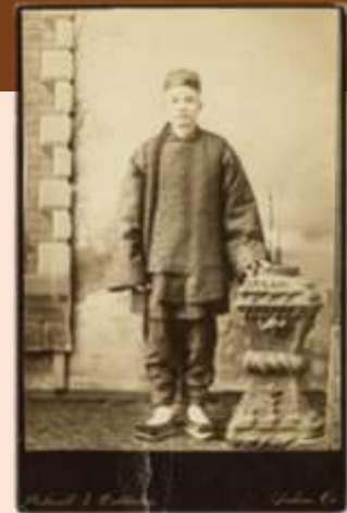
Chinese Cook from Oregon State School ca 1890